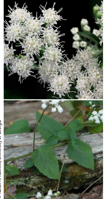
White snakeroot flowers