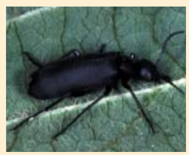
Black blister beetle

Nitrates, high levels in hay or pasture High levels of nitrates may cause death. Symptoms include increased salivation, labored breathing, uncoordination, weak pulse, muscle tremors, vomiting, diarrhea, and suffocation. A characteristic finding is the chocolate discoloration of the blood and blueness of membranes. Some weeds-pigweed, lambsquarter, and nightshade-naturally accumulate nitrates. Grasses heavily fertilized with nitrogen (including manure) or produced under drought conditions may have toxic levels of nitrate and should be tested prior to feeding. If in doubt, have hay tested at any forage testing laboratory.