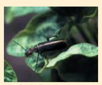
Margined blister beetle

Blister beetles (four types: striped, black, ash gray, margined) Blister beetles produce a toxic compound, cantharadin. Consuming as few as 12 beetles, even if they are killed or smashed during the hay-making process, can kill a horse. The beetle is rarely present in first cutting alfalfa. Subsequent cuttings should be made before bloom since the insect is attracted to flowering alfalfa. Blister beetles are more commonly found in hay produced in the southern United States and in periods of drought when grasshoppers are present.