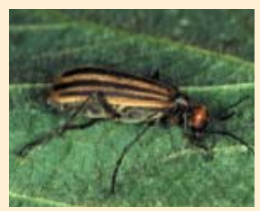
Striped blister beetle