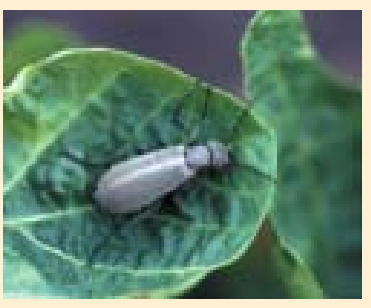
Ash gray blister beetle