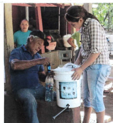
Oh to have clean drinking water!

This page is from the Nicaragua Partners of America newsletter, proceeds come from the Annual Fund Drive of 2018: This shows how our donations of sewing supplies and baking equipment are being used in Learning Centers to help students start their own businesses.